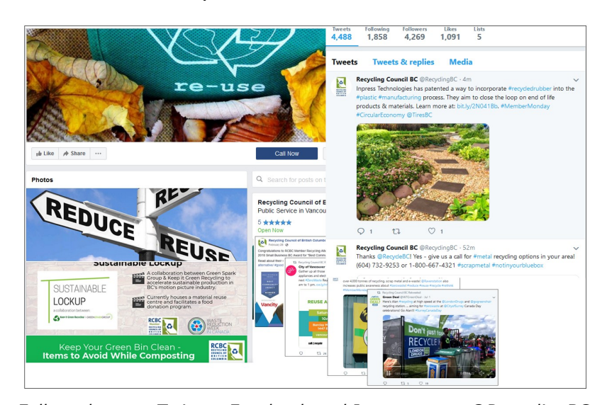
Follow along on Twitter, Facebook and Instagram at @RecyclingBC

• opportunities to share your waste reduction stories on social media.